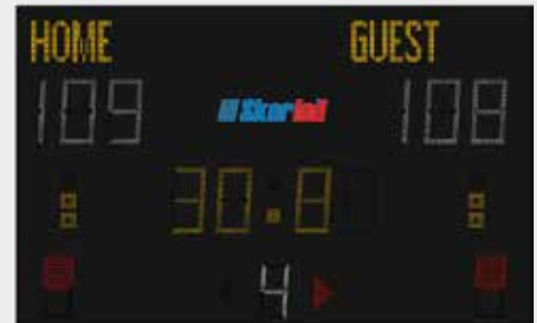
SBS 2000TH (Basic type with suspension time)