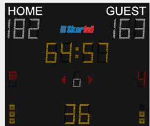
SBS 3000H (Basic type with suspension time)