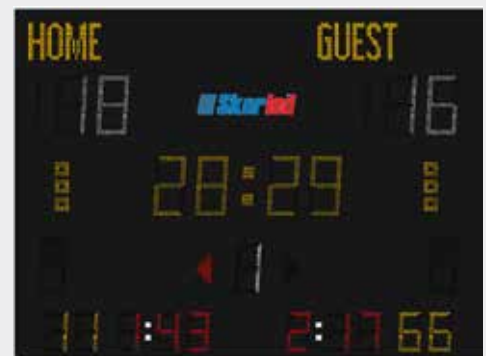
SBS 2000TB (Basic NBA type)