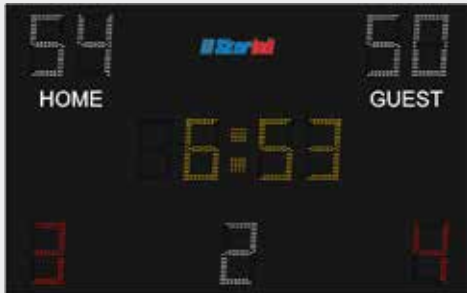
SBS 1280A (Basic type)