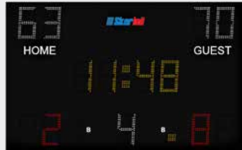
SBS 1280B (Basic NBA type)