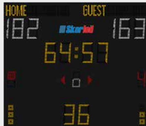
SBS 3000TH (Basic type with suspension time)