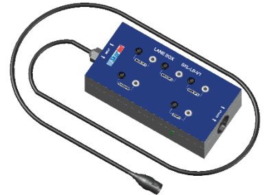
Lane Box (SKL – LB – V1)