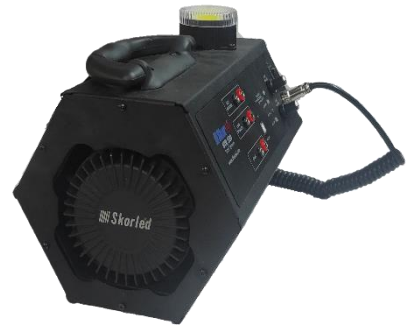
Race Starter (STR – 100)