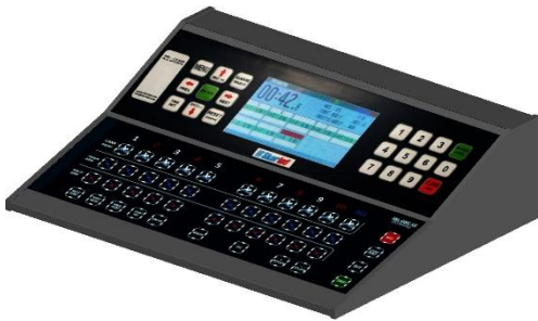
Swimming Controller (Timer) (SKL – SWC – V2)